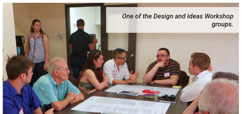
One of the Design and Ideas Workshop groups.