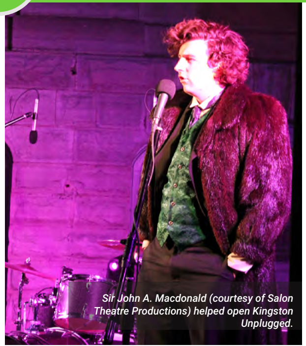
Sir John A. Macdonald helped open Kingston Unplugged.