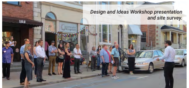
Design and Ideas Workshop presentation and site survey.