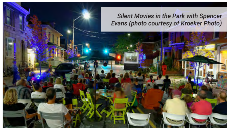
Silent Movies in the Park with Spencer Evans