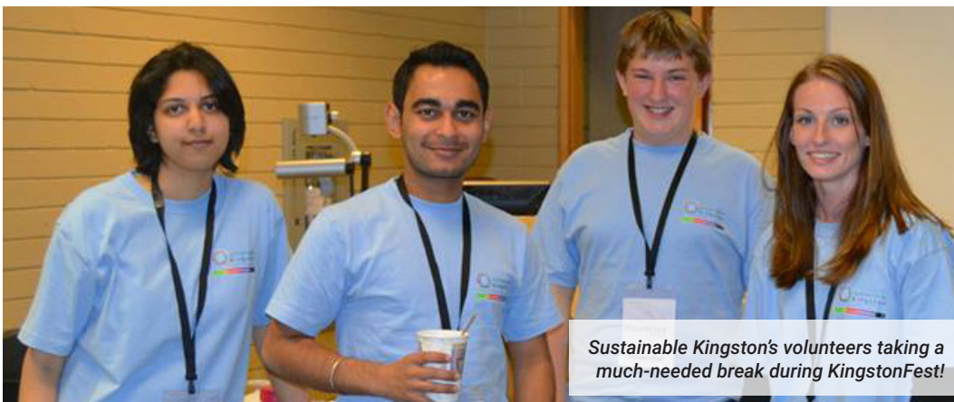
Sustainable Kingston's volunteers taking a much-needed break during KingstonFest!

In 2014, Sustainable Kingston hosted its first annual KingstonFest, an event that brought together organizations working to promote the city's four pillar sustainability strategy. More than 1,000 people dropped by the event, which was held at St. Lawrence College, to find out more about making Kingston Canada's most sustainable city. Thank you to all the Sustainable Kingston Community Partners, local performers, local food vendors and other businesses, and especially our dedicated team of volunteers for making this event a success!